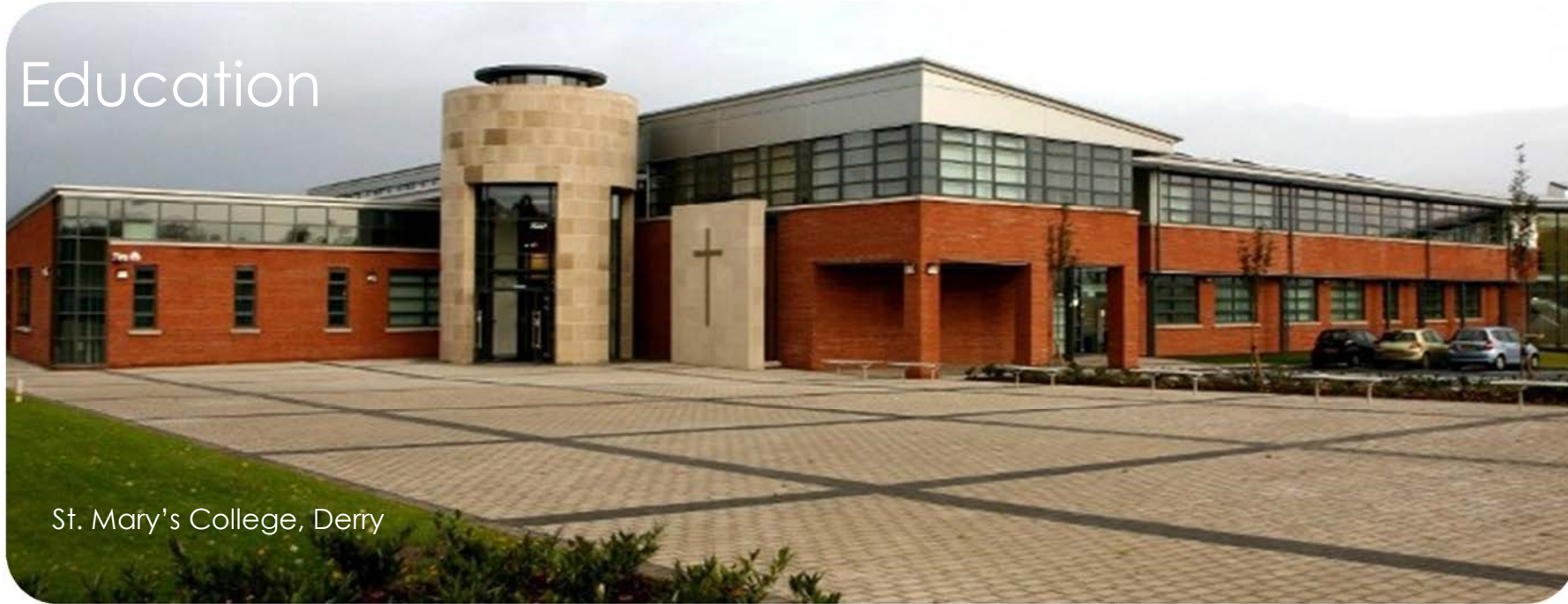
St. Mary's College, Derry