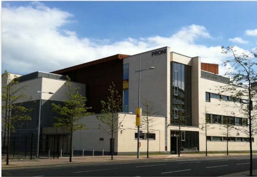
Public Records Office Northern Ireland, Belfast