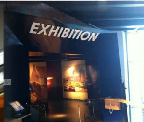
Titanic Signature Building, Belfast