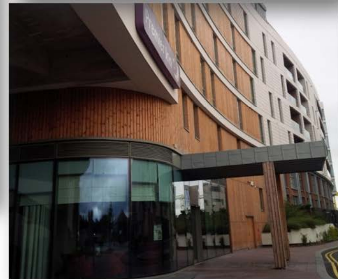
Premier Inn, Titanic Quarter, Belfast