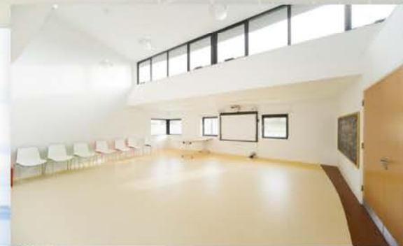
Davey Village, Corrymeela, Ballycastle