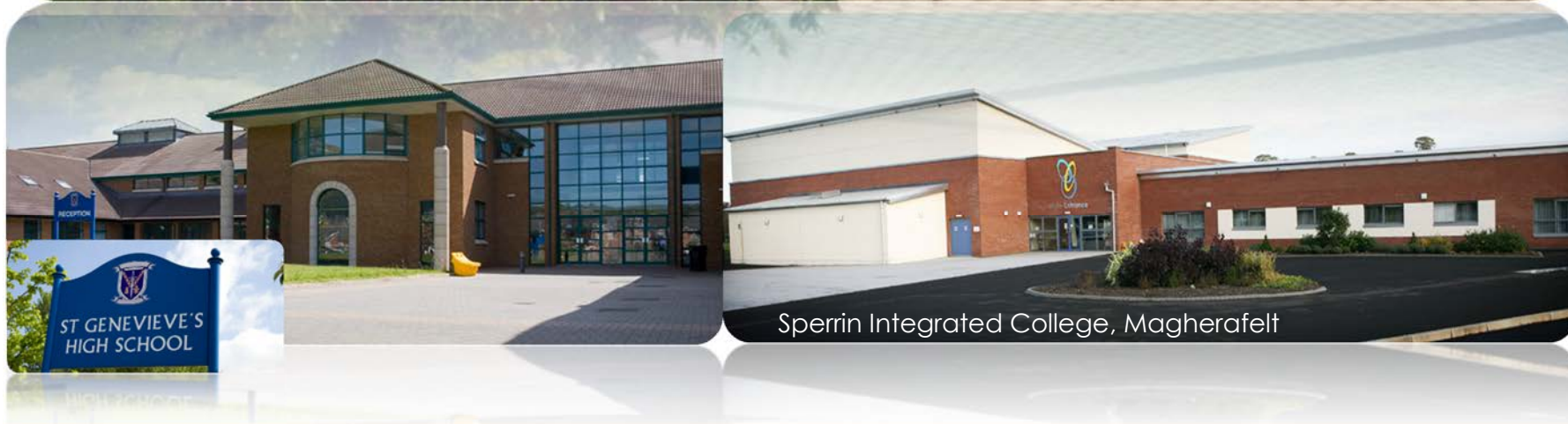
Sperrin Integrated College, Magherafelt